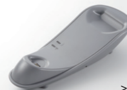
> AS-8020CL charging cradle