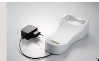
> AS-8520 charging cradle