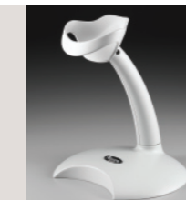
> AS-8000 stand