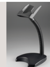
> AS-8120 stand